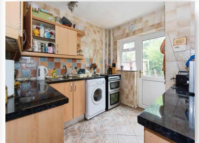
Clewley Grove, Quinton Birmingham B32 1QZ