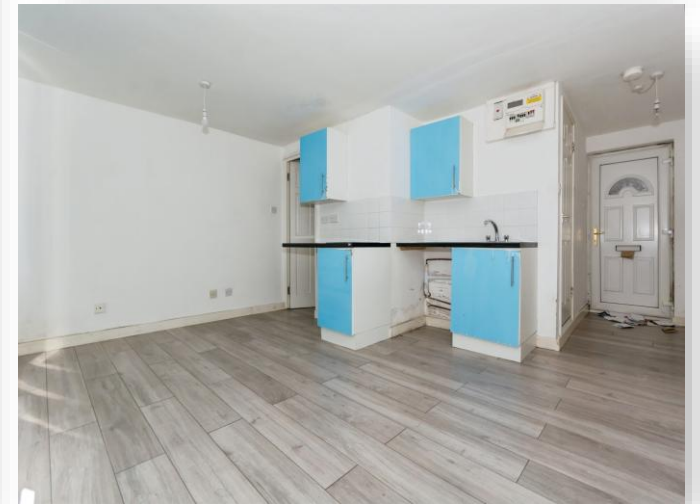
Unett Court St. Matthews Road, Smethwick B66 3TN