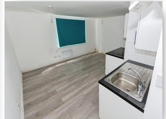
Unett Court St. Matthews Road, Smethwick B66 3TN