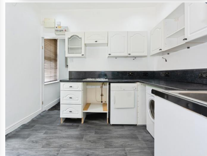
Flat 2 Summerfield Crescent, Birmingham B16 0EN