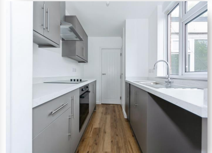
Salisbury Close, Birmingham B13 8JX