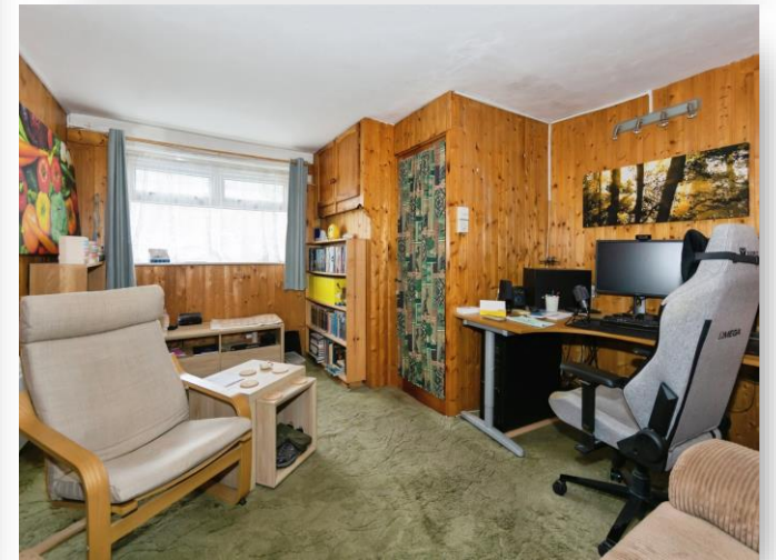
The Hill, Birmingham B32 3RT