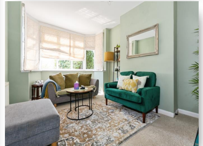
Quinton Road, Birmingham B17 0RB