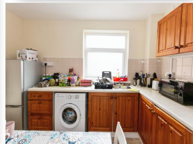
William Court Clarendon Road, Birmingham B16 9SD