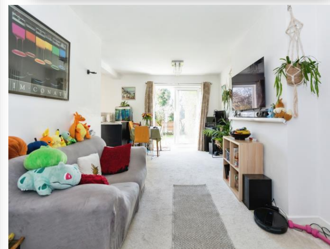
Capern Grove, Birmingham B32 2JJ