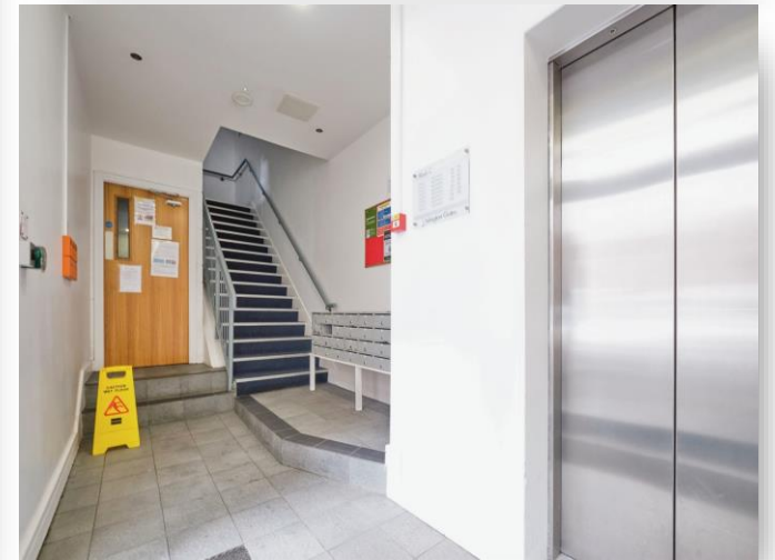
Islington Gates Fleet Street, Birmingham B3 1JL