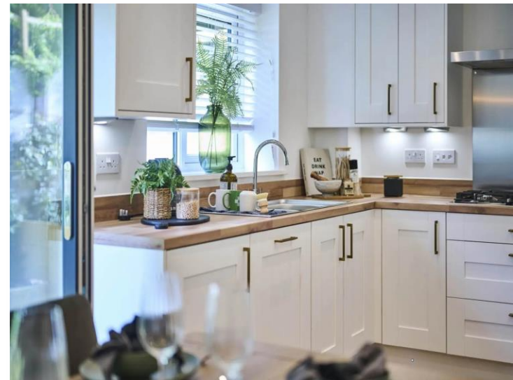
The Hexham West Works, Rednal Birmingham B45 9UA