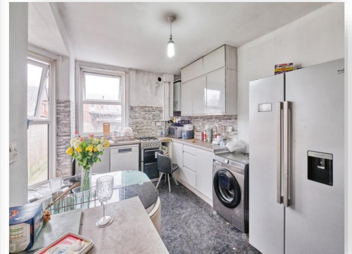
Eastwood Road, Balsall Heath Birmingham B12 9NB