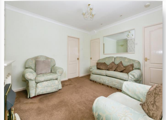
West Boulevard, Birmingham B32 2PH