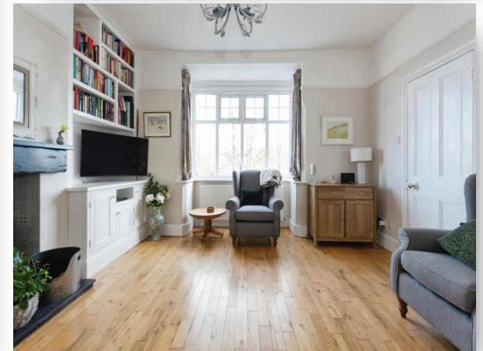
Northfield Road, Harborne Birmingham B17 0TA