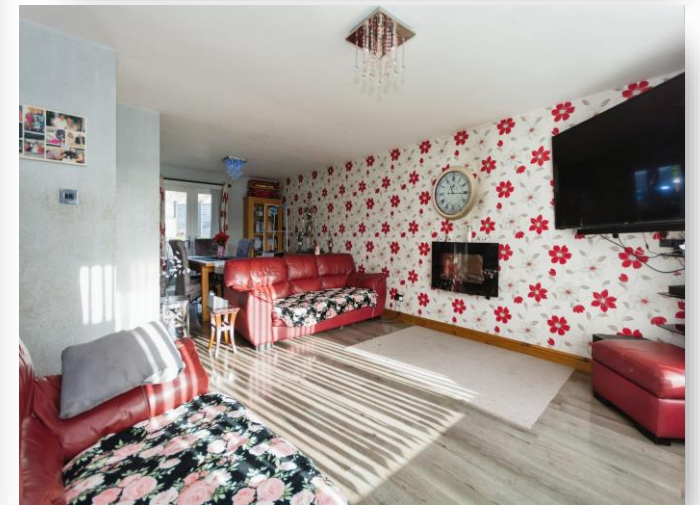
Amersham Close, Quinton Birmingham B32 2QU