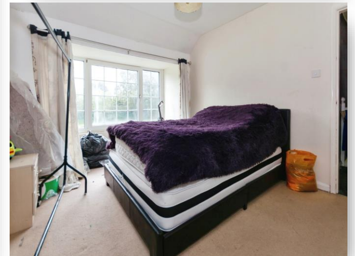
Wolverhampton Road, Oldbury B68 8DD