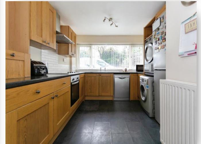
Bunbury Road, Birmingham B31 2DR