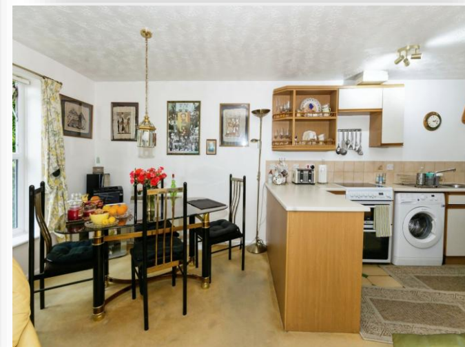
Mariner Avenue, Birmingham B16 9DL