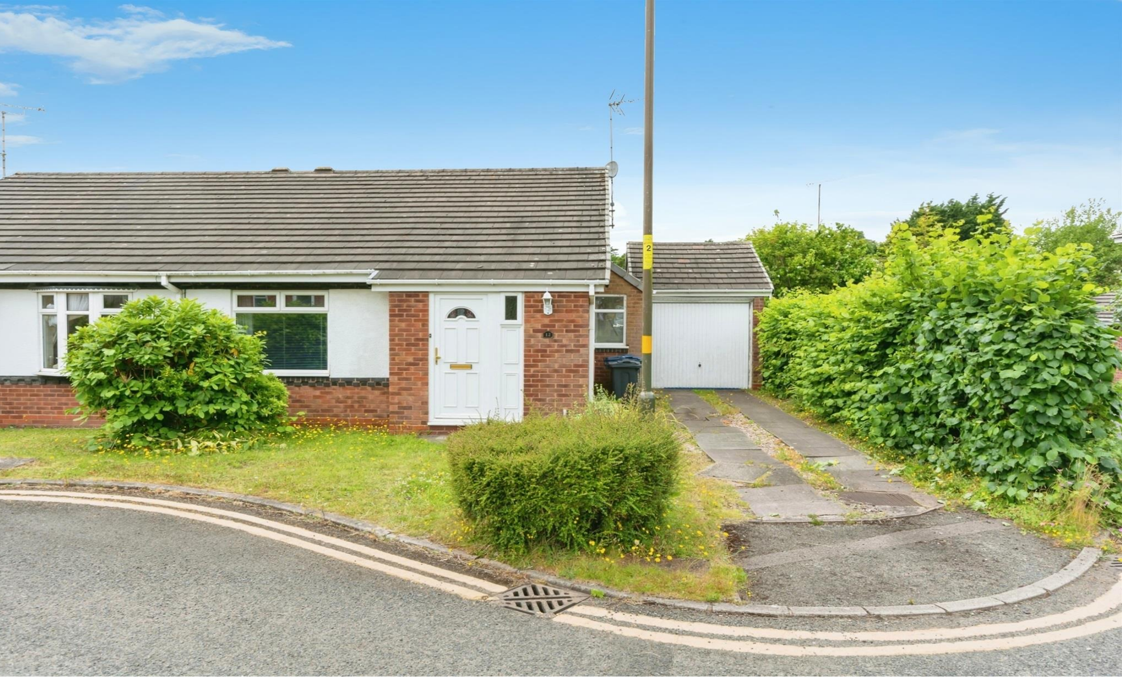
Iliffe Way, Birmingham B17 0JW