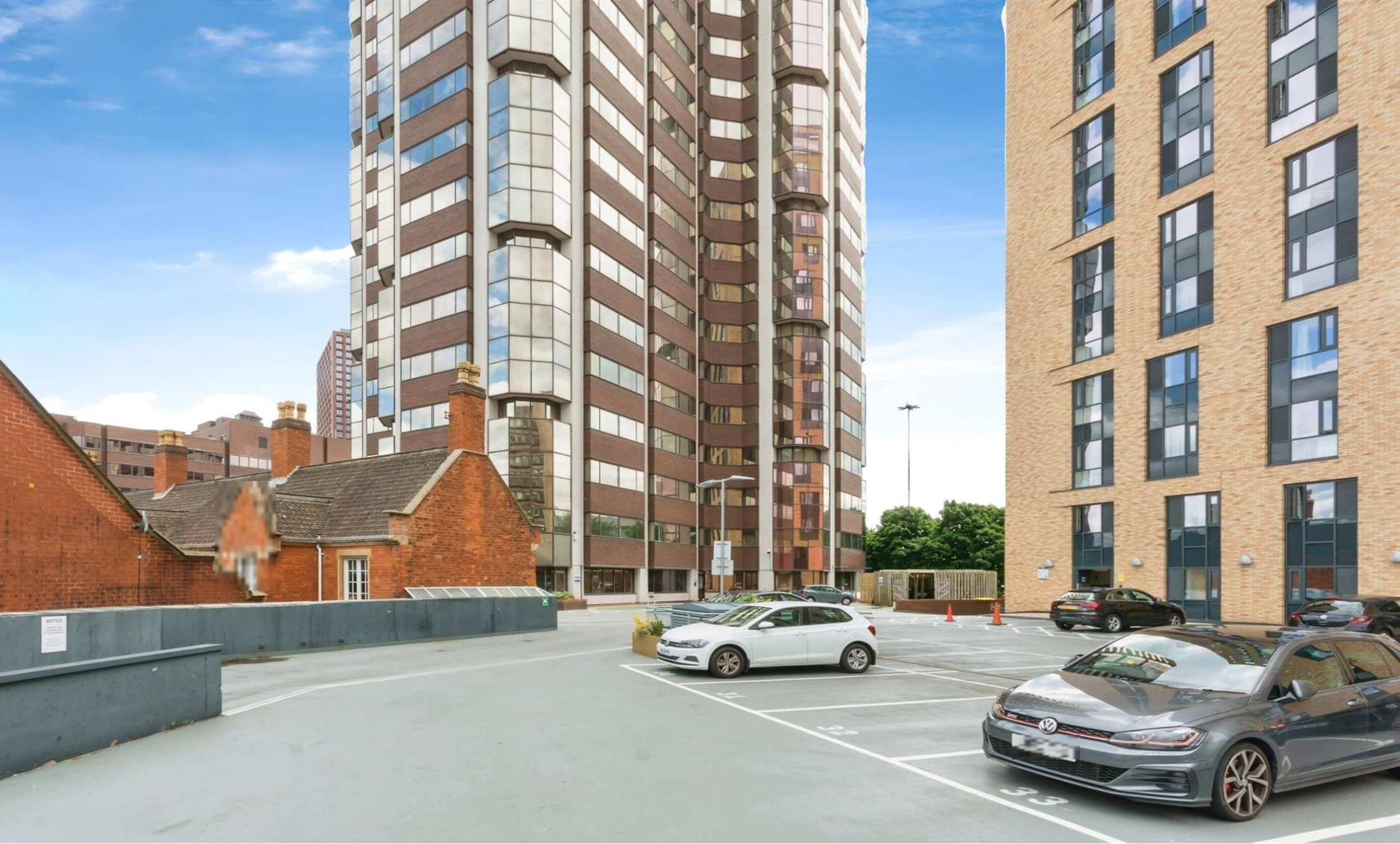
Metropolitan House Hagley Road, Birmingham B16 8HU