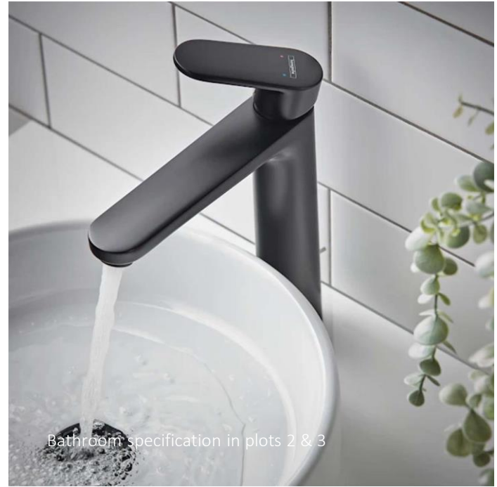
Bathroom specification in plots 2 & 3