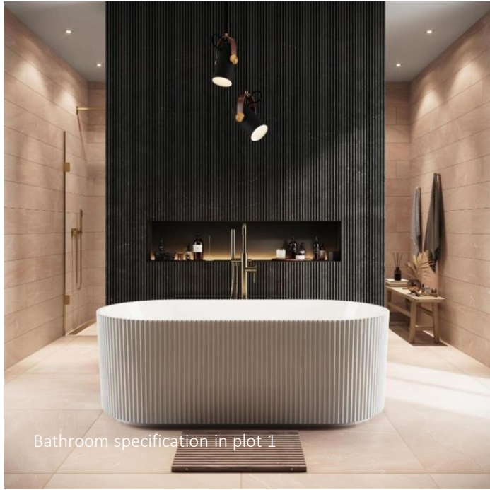
Bathroom specification in plot 1