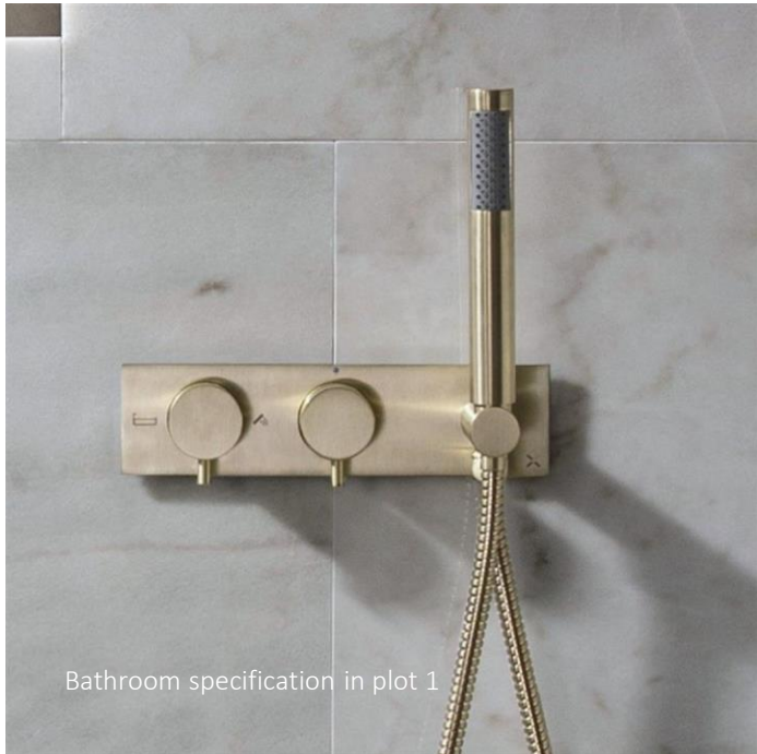
Bathroom specification in plot 1