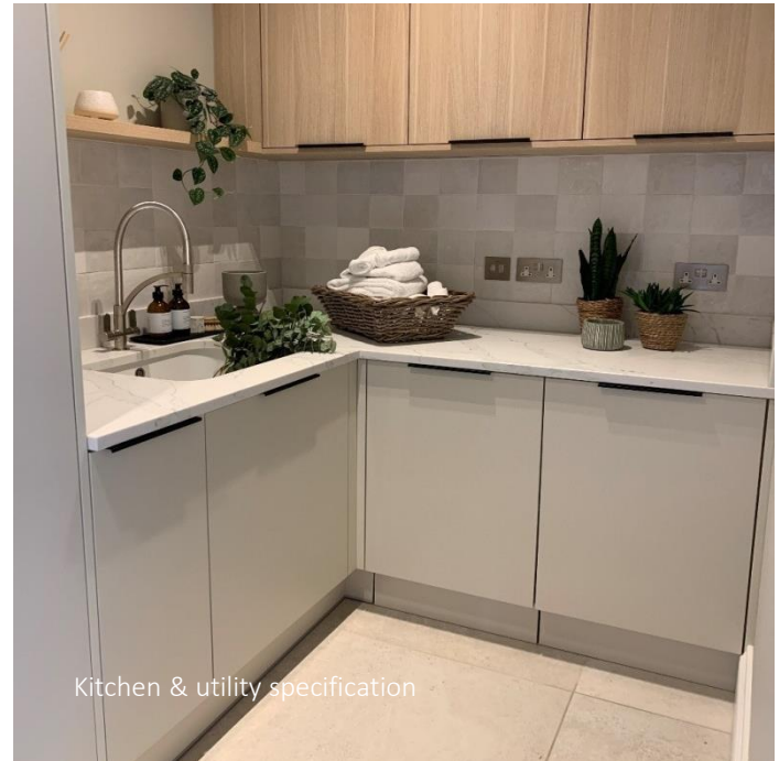
Kitchen & utility specification