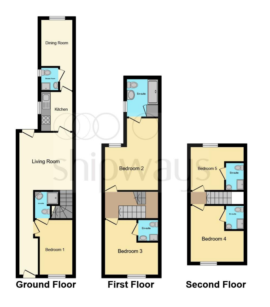
This floorplan is for illustrative purposes only and is not drawn to scale. Measurements, floor-areas, openings and orientations are approximate. They should not be relied upon for any purpose and do not form any part of an agreement. No liability is taken for any error or mis-statement. All parties must rely on their own inspections.