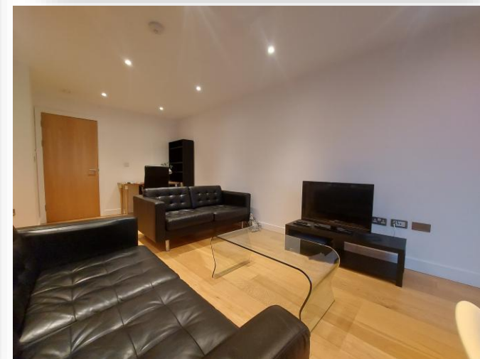
Meridian Plaza Bute Terrace, Cardiff CF10 2FQ