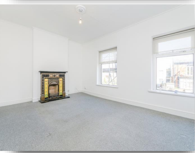
First Floor Flat Romilly Crescent, Cardiff CF11 9NQ