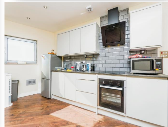
Altolusso Bute Terrace, Cardiff CF10 2FH