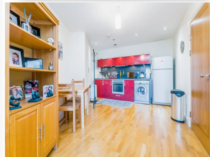
Altolusso Bute Terrace, Cardiff CF10 2FF