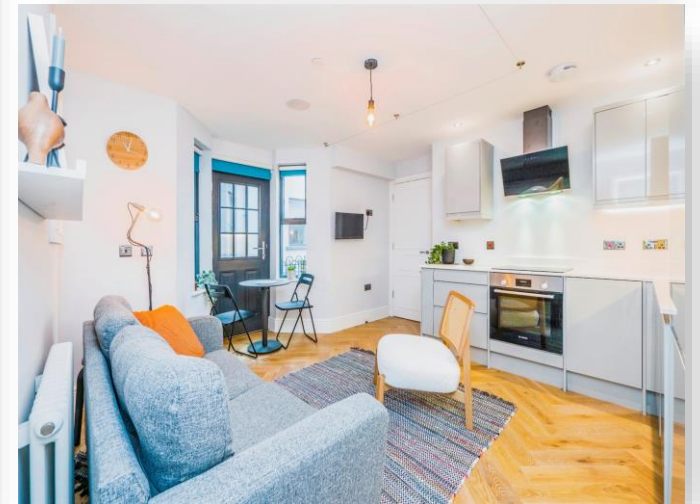
Kestral Mews Cathedral Road, Cardiff CF11 9LS