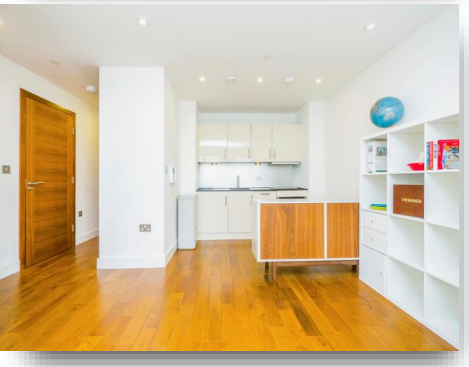
Hayes Apartments The Hayes, Cardiff CF10 1AQ