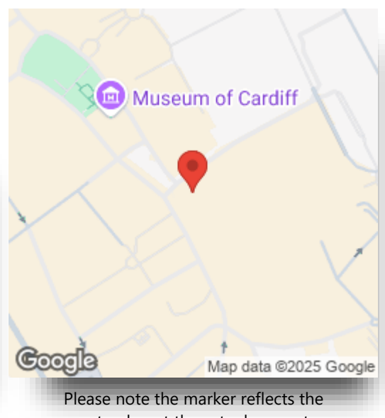
postcode not the actual property