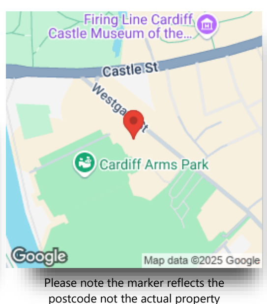
view this property online allenandharris.co.uk/Property/CRP107619