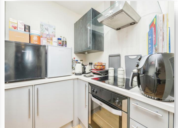
Landmark Place, Cardiff CF10 2HT