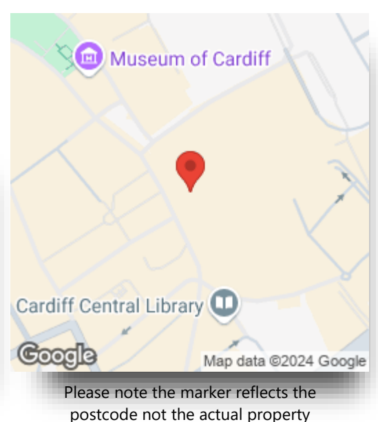
view this property online allenandharris.co.uk/Property/CRP106335