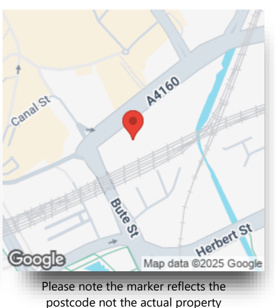
view this property online allenandharris.co.uk/Property/CRP107516