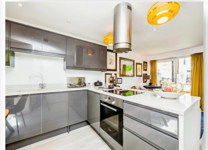
Sir Walter Mews, Cardiff CF11 9EQ