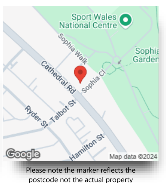
view this property online allenandharris.co.uk/Property/CRP107537