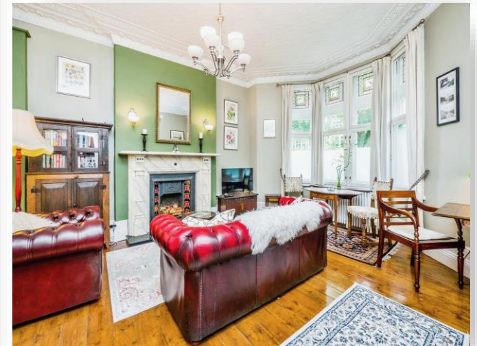
Cathedral Road, Cardiff CF11 9LN