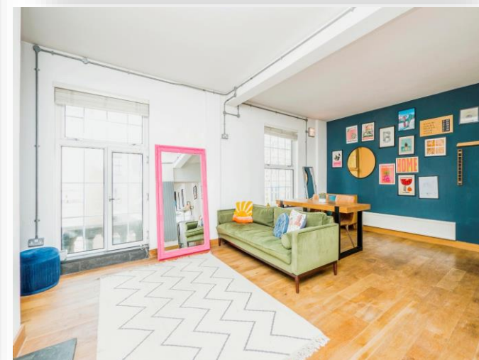
Kenilworth House Westgate Street, Cardiff CF10 1DJ