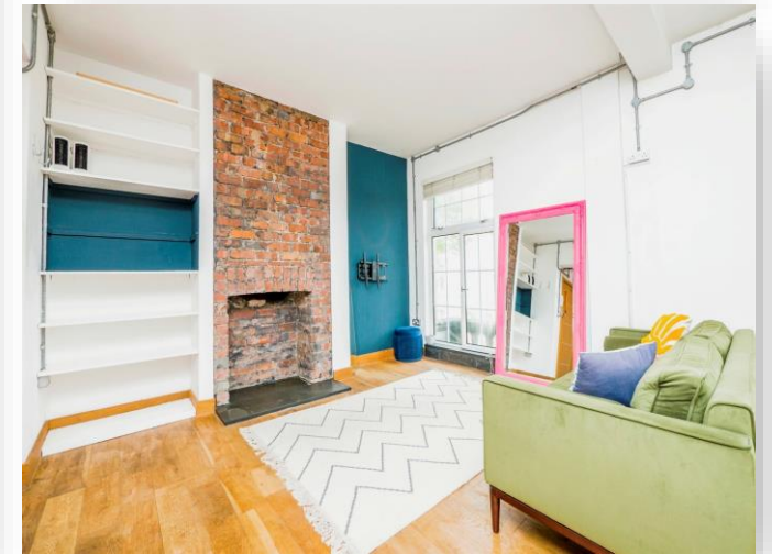
Kenilworth House Westgate Street, Cardiff CF10 1DJ