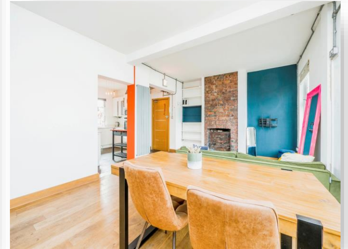
Kenilworth House Westgate Street, Cardiff CF10 1DJ