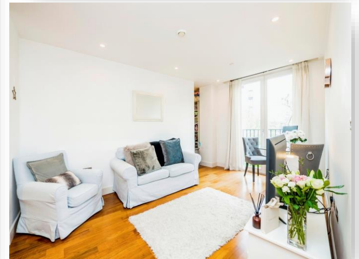
Hayes Apartments, The Hayes, Cardiff CF10 1EF