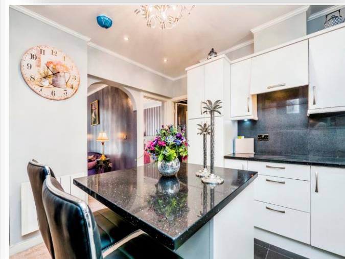
Dunraven House Westgate Street, Cardiff CF10 1DL