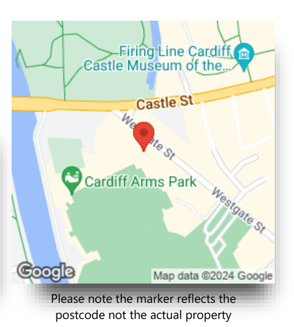
view this property online allenandharris.co.uk/Property/CRP105827