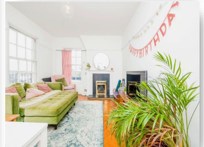
Branksome House Westgate Street, Cardiff CF10 1DF