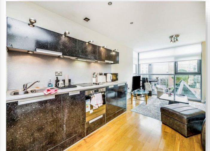
Altolusso Bute Terrace, Cardiff CF10 2FF