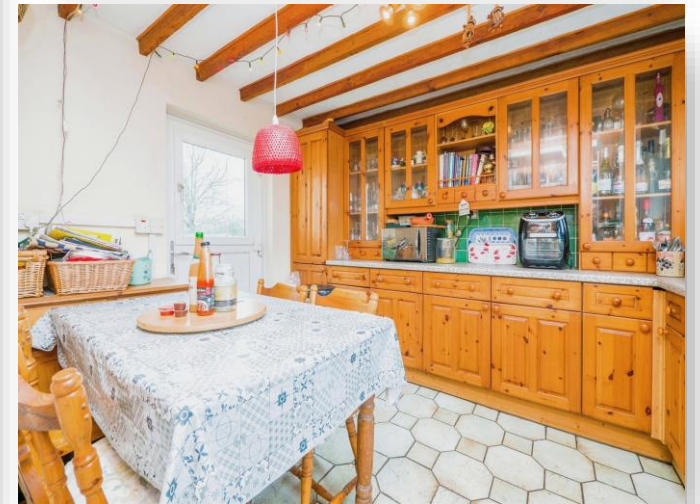
Nash View, Pentre Meyrick Cowbridge CF71 7RP