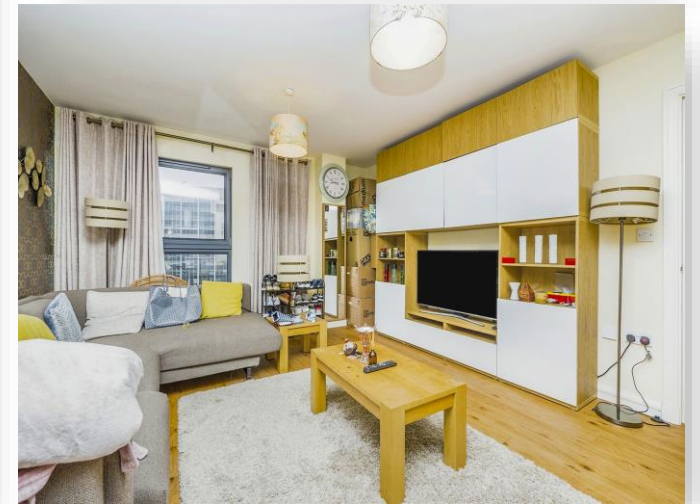
Landmark Place Churchill Way, Cardiff CF10 2HT