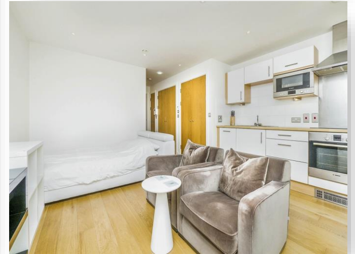
Meridian Plaza Bute Terrace, Cardiff CF10 2FQ