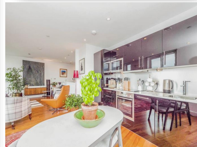
The Hayes, Cardiff CF10 1AQ