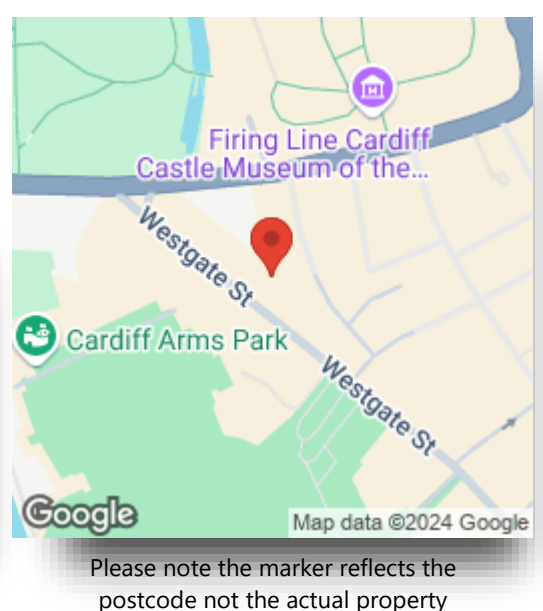
view this property online allenandharris.co.uk/Property/CRP107112