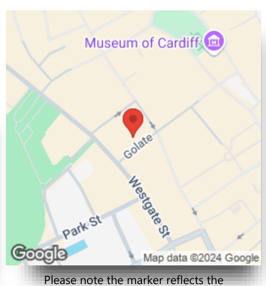
postcode not the actual property