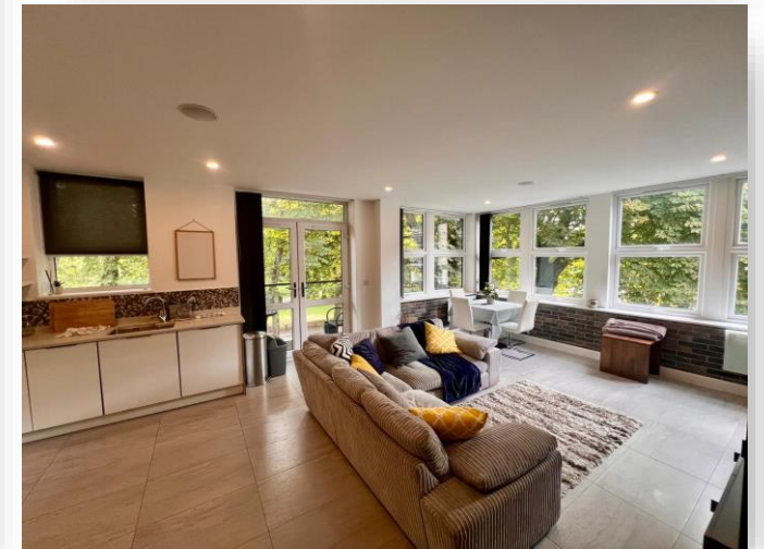
Cathedral Road, Cardiff CF11 9FH